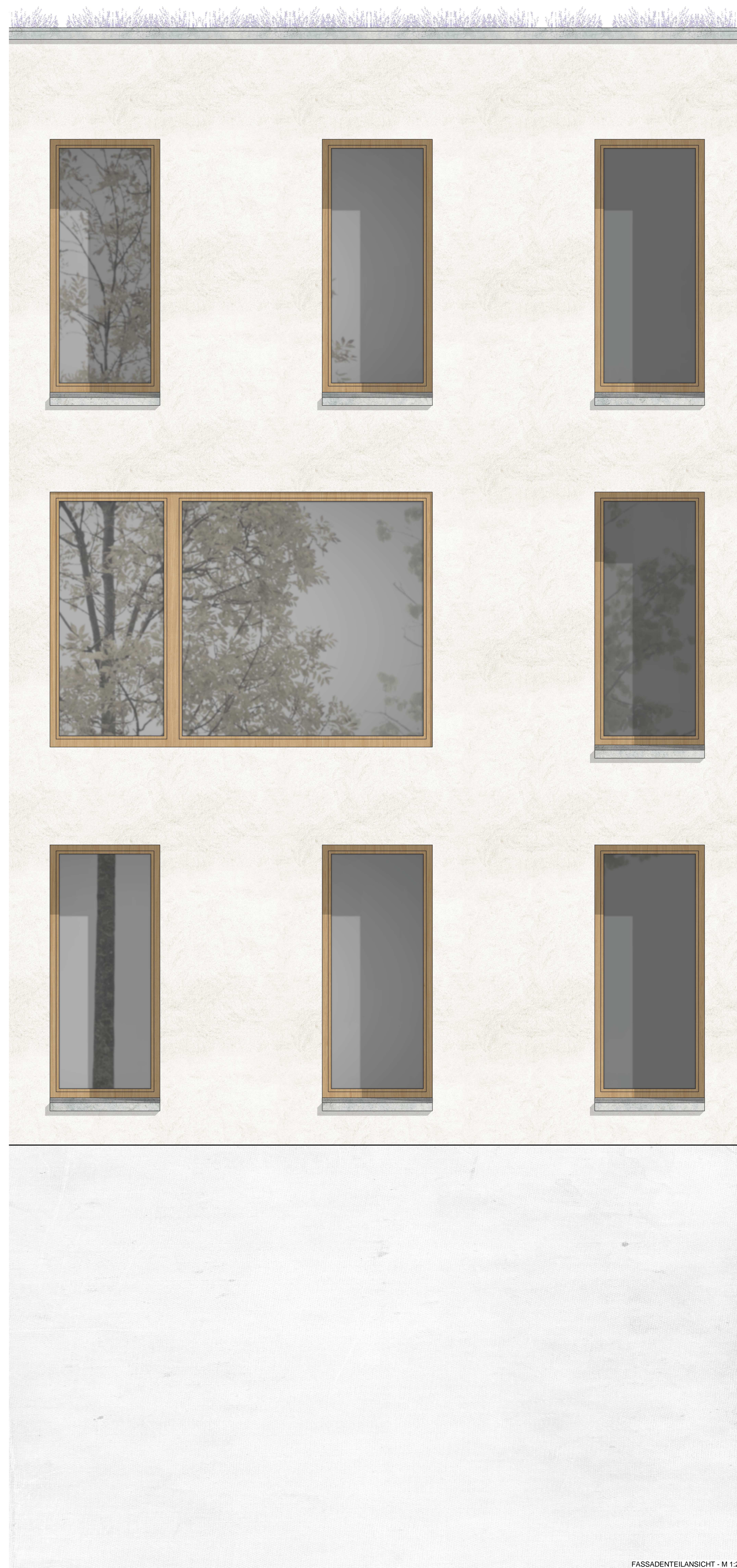
FASSADENTEILANSICHT - M 1:20