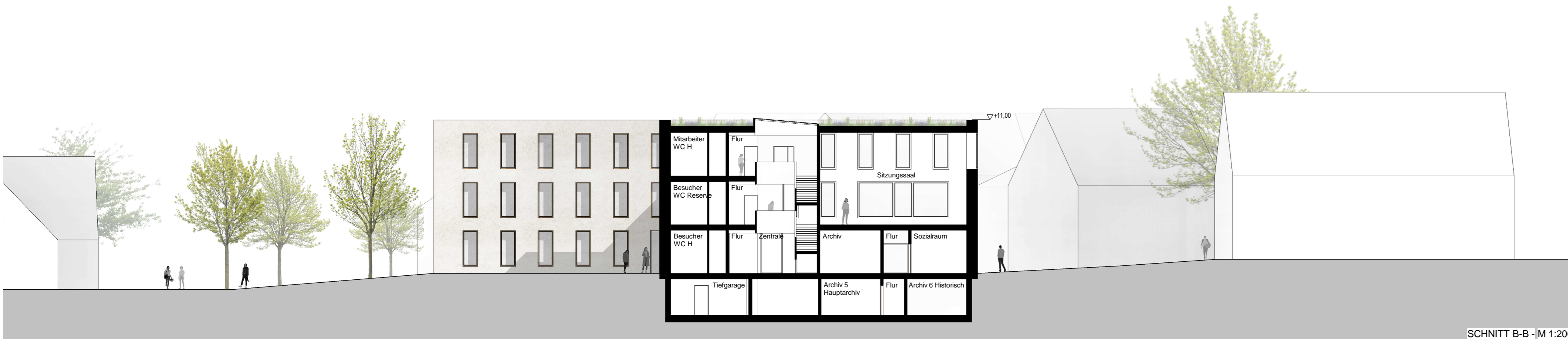
SCHNITT B-B - M 1:200